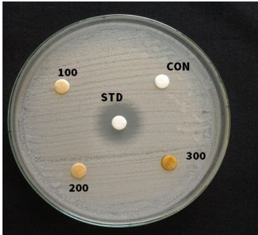
Figure 3: Anti- Microbial Effect of PN against Candida albicans