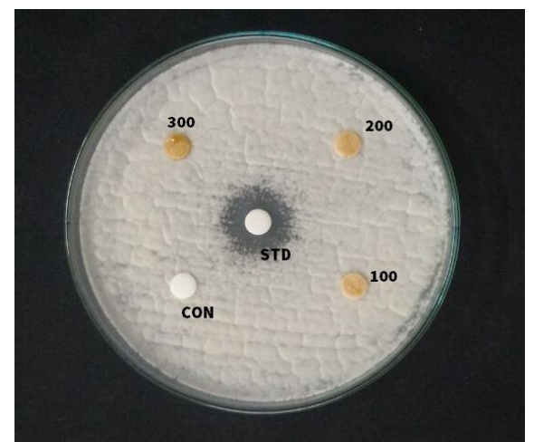
Figure 4: Anti- Microbial Effect of PN against Aspergillusniger